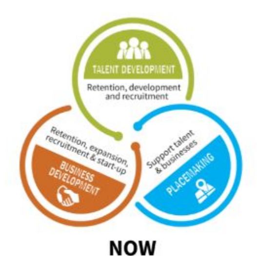
Expanded Focus Integrates Talent and Placemaking