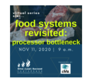
Virtual Series VI: Food Systems Revisited – Processor Bottleneck With COVID disruptions, there is now interest in exploring whether "reinvesting" in a more diverse portfolio of plants of different sizes would be more resilient...

Virtual Series V: Are Opportunity Zones still a Game Changer? A panel OZ experts will discuss the present & future of the OZ Program, and whether the program remains the "game changer" it promised to be at its inception.